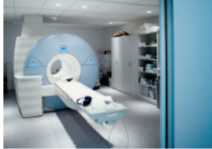
Outstanding diagnostic quality: The University Medical Center Mannheim relies on the high-end CT scanner SOMATOM Definition and the MR system MAGNETOM Avanto.

arrive at the diagnosis, and the cardiologists make the necessary interventions, if required. To this end, we require an excellent workflow since every second counts when suspecting coronary artery disease in an acute setting. In addition, decisions regarding the therapeutic approach have to be supported by hard data more than ever due to our steadily decreasing healthcare resources. The high image quality and the informative value of Dual Source CT supply exactly this data.”